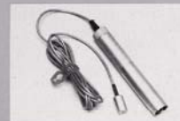
CL-4 BD (1101)