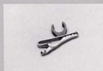
Microphone tie clip (3300)