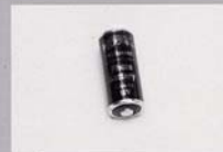
15 V battery (5115)