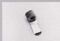
Amplifier belt clip (3301)