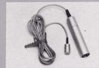
CL-4 AD (1100)